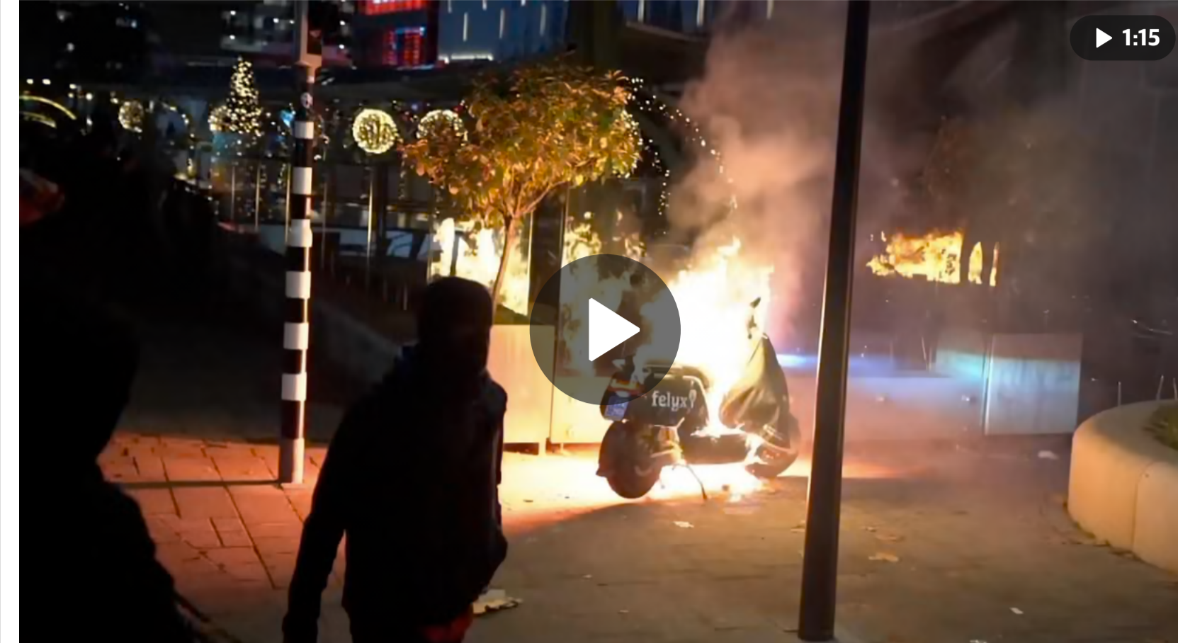
Rotterdam riot: police fire shots as Covid protesters torch vehicles - video

Three people were being treated in hospital in Rotterdam on Saturday after they were seriously injured when police fired shots during a demonstration against Covid-19 restrictions.